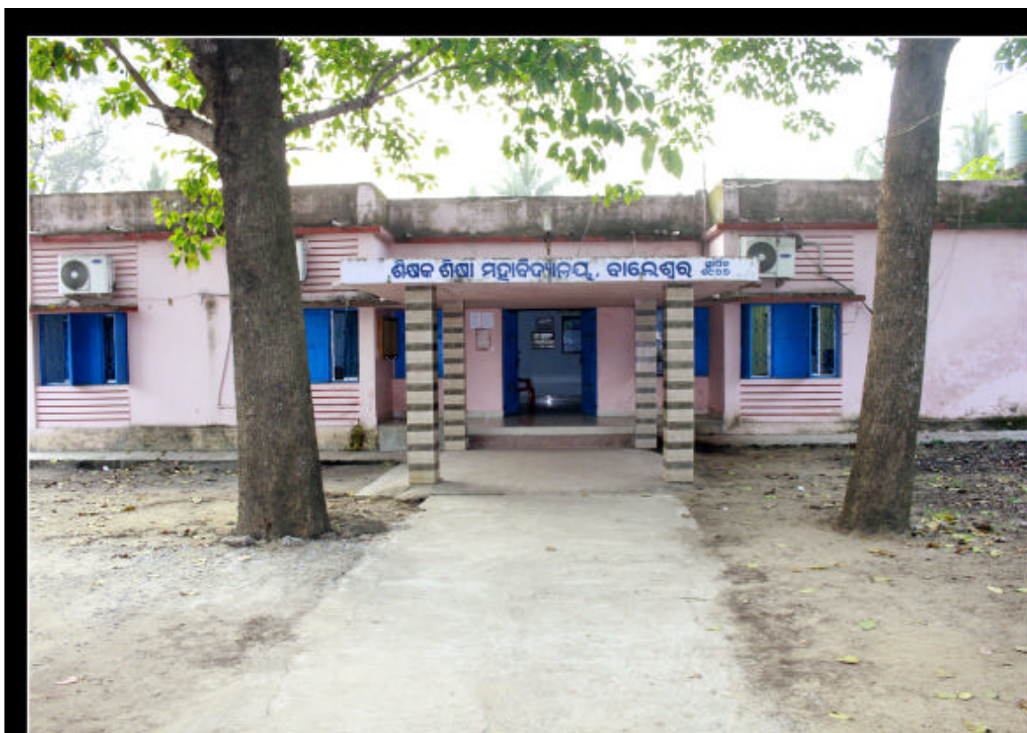
Administrative Building, College of Teacher Education, Balasore, Odisha