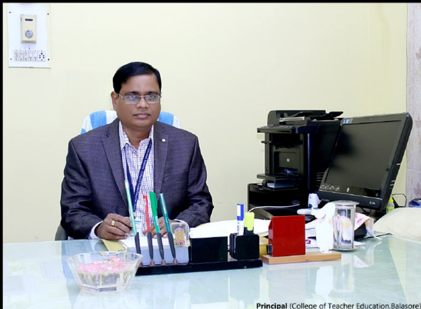
Principal (College of Teacher Education, Balasore)